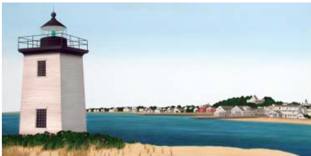
detail Land's End Mural , Peter Macara

The exhibition will include paintings and photographs. "They will be related to the fishing fleet—waterfront, fishing boats—some that will be recognizable to a good number of people, and others that people might not know what they are," Van Dereck says. Black and white images of 1920s seiners out of Gloucester may hang next to images of trap barges, weir poles, or fishermen and their families. Together they will present a story of