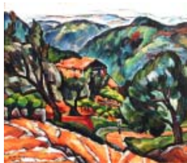
La Gaude, Oliver Newbury Chaffee

The Museum School at PAAM catalog is available online at PAAM.org, or by calling 508-487-1750 x13. It features thirty-four classes in the visual arts and the written word offered over an eight-week period with many of the instructors drawn from the membership.