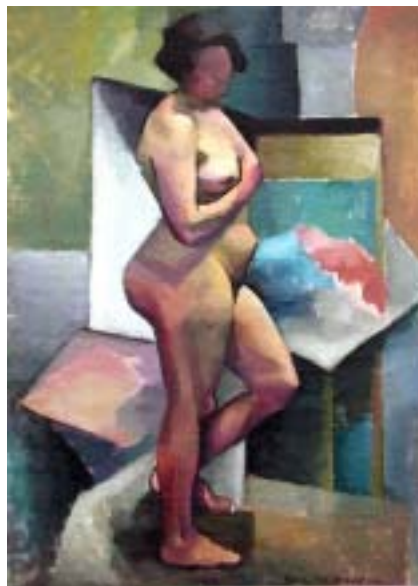
Nude, Blanche Lazzell

The Consignment Auction Preview opens with a reception on May 6, 7-9pm, and continues through May 21. The Auction begins at 7pm on Saturday, May 21.